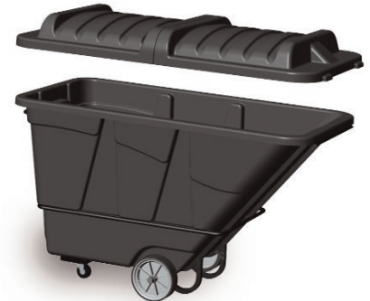
5849 Shown w/ 5853 Lid