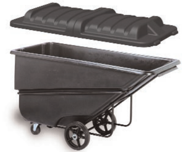
5835 Shown w/ 5837 Lid