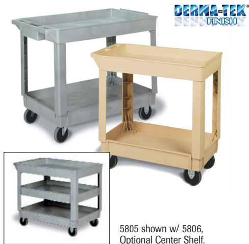
5805 shown w/ 5806, Optional Center Shelf.

The 5800 and 5805 two shelf Utility Carts feature 5" heavy-duty, non-marking grey casters for industrial use. Supports 200 lbs. per shelf, 400 lbs. maximum capacity. Optional center shelf available.