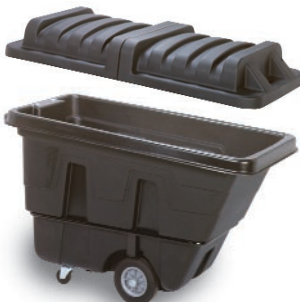
5840 Shown w/ 5843 Lid